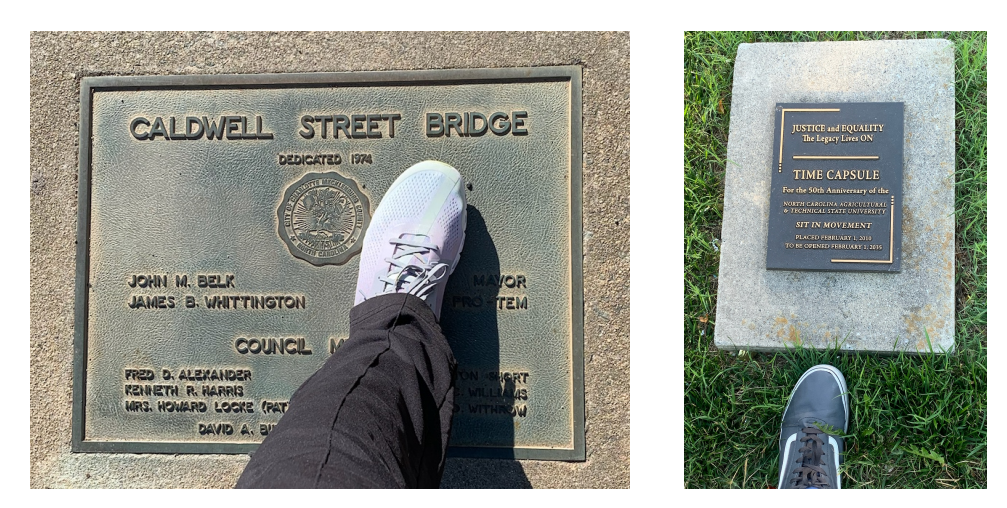
"Our feet are on the ground of the Community we serve, like no other."

770 833.6277 support@del-nabla.com www.inbits.tech